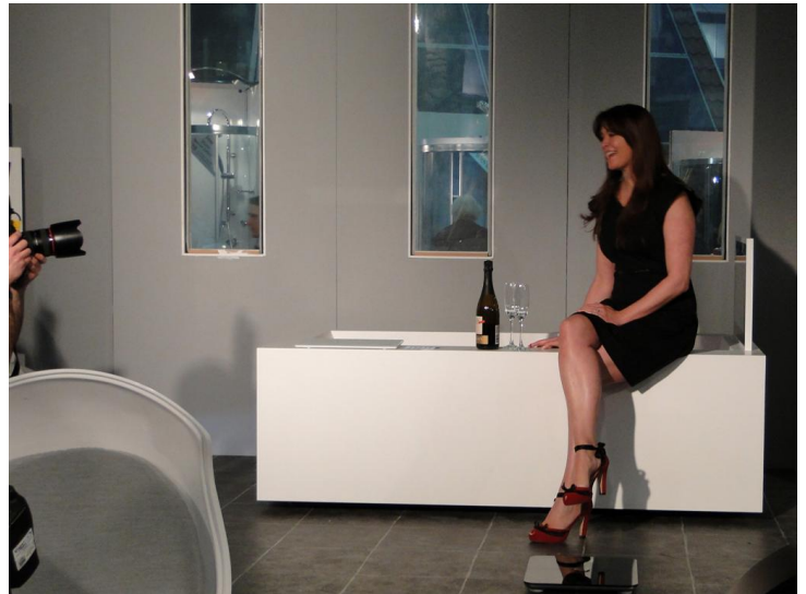
Suzi Perry with bathomatic bathler 005 at its launch at the Home of the Future at Ideal Home Show 11 th March 2011

In March 2008 bathovision® was born. In a TV saturated market we introduced a bathroom TV with a difference. This was aimed to out-style and out-feature all other bathroom TVs and for the first time offer control of auxiliary devices, such as lights, sound, bathomatic®, etc. via an on screen display and interaction with the remote.